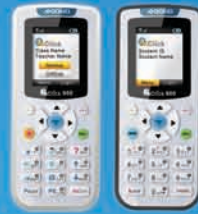
Audience Response System