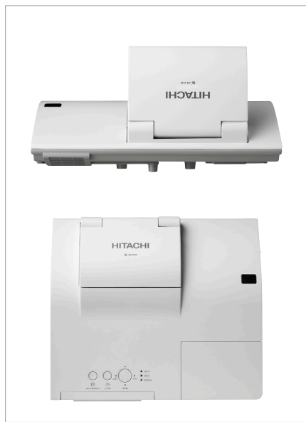
Aspect Ratio 4:3