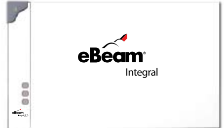
Series 82 - 190cm x 120cm (Being discontinued)