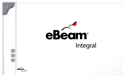
Series 78 - 160cm x 127cm