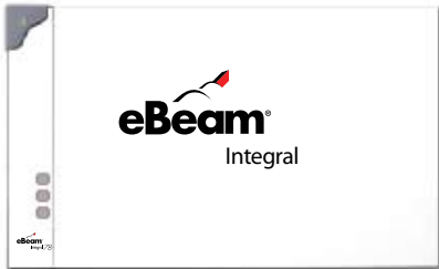
Series 65 - 158.2cm x 121cm