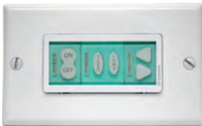
PXE-DCM-GREEN Horizontal with Decora Wall Plate (not included)