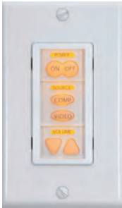
PXE-DCM-AMBER with Decora Wall Plate (not included)