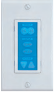
PXE-DCM-BLUE with Decora Wall Plate (not included)

Single-gang IR control system for projectors and display devices.