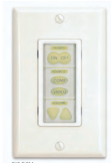
PXE-DCM Pictured with Leviton Decora™ wall plate (not included).

▼ Wireless cloning allows quick programming of many units